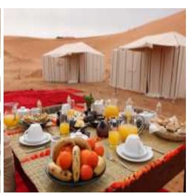
Day 7: Merzouga – Tinghir – Skoura Approx 5 hours drive

After Merzouga, you drive towards Skoura, En route you pass by the most spectacular natural environments Gorges of Todra and if still time you will visit also the Dades gorges. The Gorge du Dadès, distinct from the Todra Gorge with its fields of fig and myriad vegetation and continue to the Todra Gorge. Craggy and colourful rock walls up to 1,000 feet high loom over a lush narrow valley dotted with oasis-like date palmeries and irrigated fields of grain. In contrast to the much-anticipated Sahara, these gorges may be the most unexpected pleasure of the trip. You can walk to explore its depths.